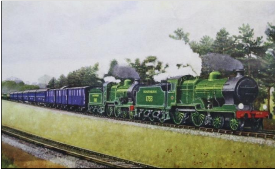
A pair of NBL L1 4-4-0's double head the sleeping cars on a 528 tons Paris to London boat train circa 1937