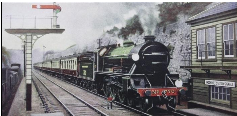
SR 'Scotch Arthur' 4-6-0 No 770 'Sir Prianus' is seen passing Knockholt with a Pullman express circa 1926